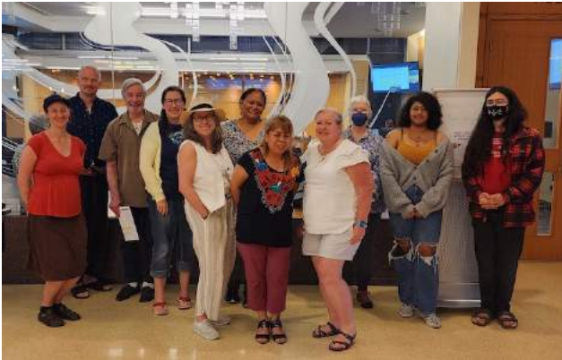
TESTIFYING AT THE BURIEN CITY COUNCIL

This year, we built on that victory by organizing for higher minimum wages in several other King County jurisdictions. Working with labor and community allies, we pushed for legislation similar to Tukwila's in unincorporated King County— including White Center, Skyway, and Vashon Island, among many other regions—and in the City of Burien. While neither of these bills have yet been passed into law, we expect the King County Council to take action early next year for unincorporated areas. We are working with allies and community members to decide next steps in Burien.